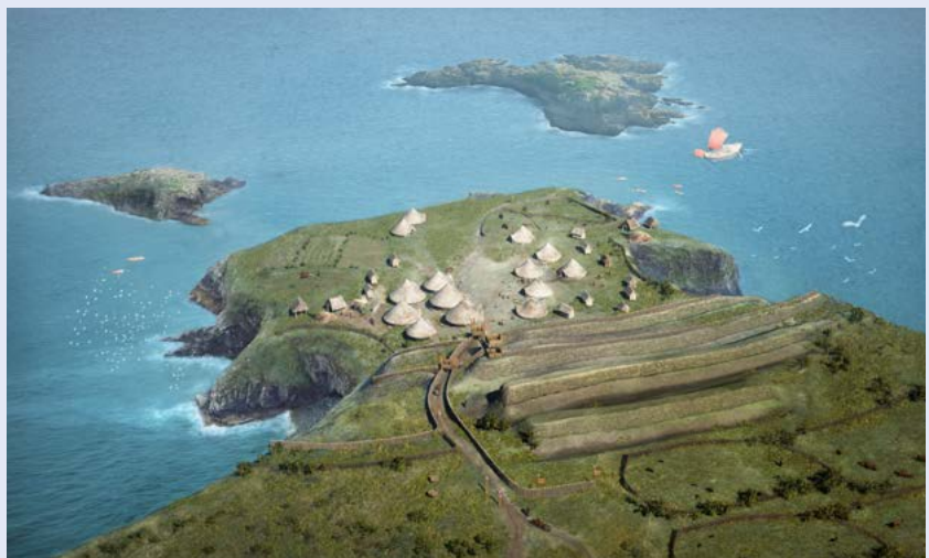
Reconstruction of Caerfai Iron Age promontory fort in Pembrokeshire. Reconstruction by Wessex Archaeology.

This resource is intended for progression steps 3-5 ; however the suggested activity can be adapted for a variety of progression steps.