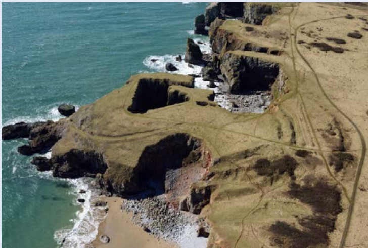
Flimston Bay Promontory fort. The remains of the defence to the fort can be seen in the ramparts on the right side of the image.